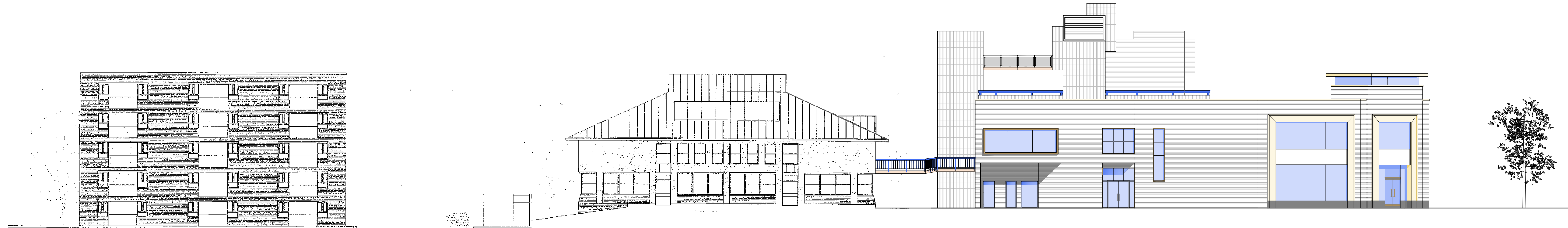
02-PROPOSED BRONDESBURY ROAD ELEVATION