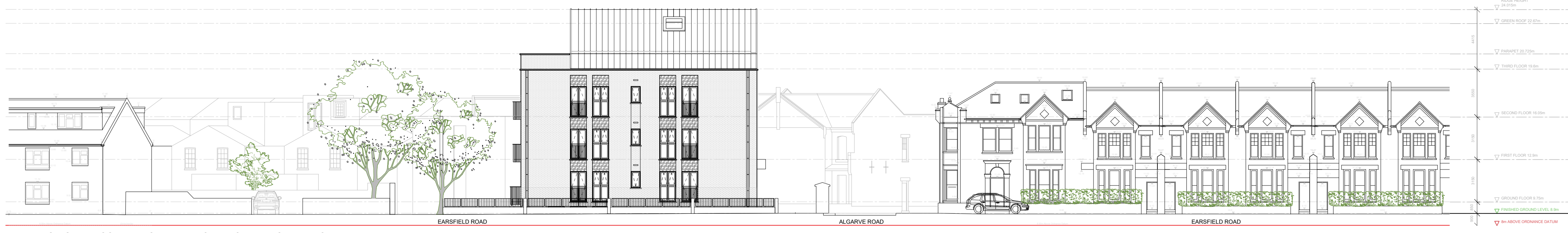
ELEVATION ON A-A SOUTH EAST ELEVATION FROM EARLSFIELD ROAD