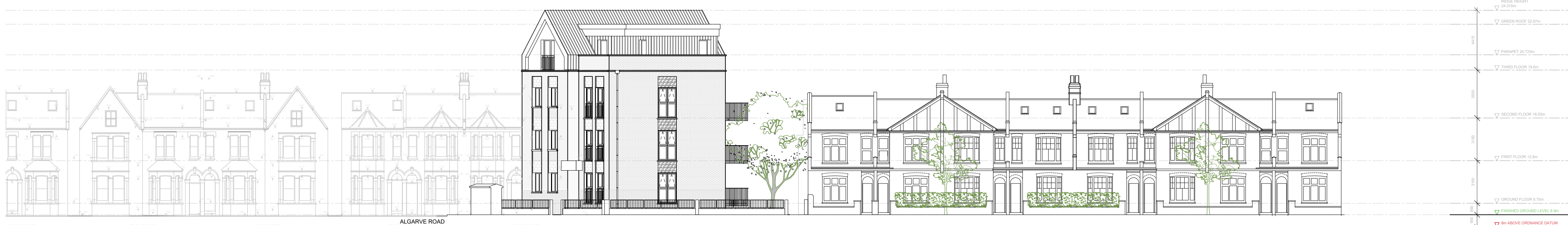
ELEVATION ON C-C NORTH WEST ELEVATION FROM ALGARVE ROAD