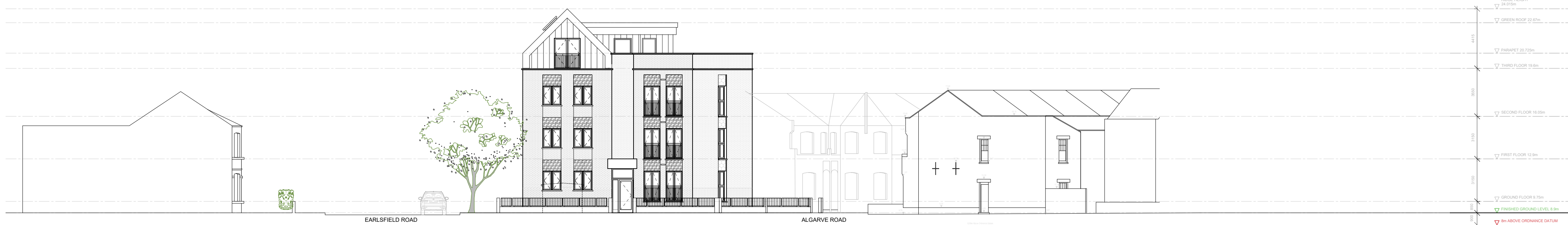
ELEVATION ON B-B NORTH EAST ELEVATION FROM ALGARVE ROAD