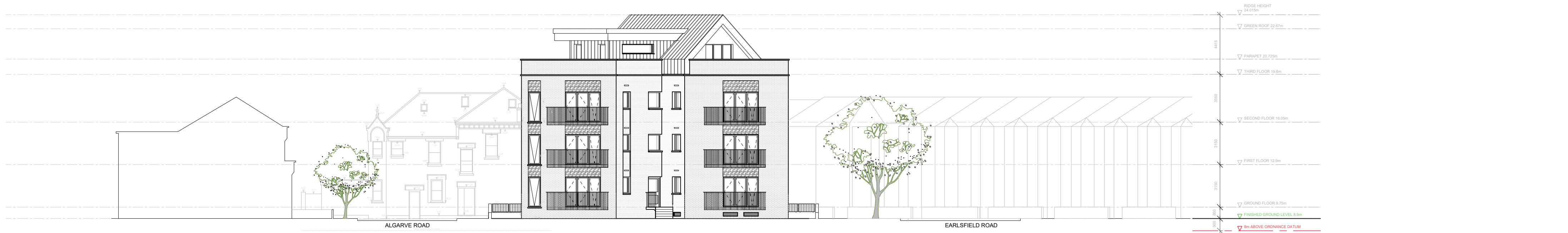
ELEVATION ON D-D SOUTH WEST ELEVATION