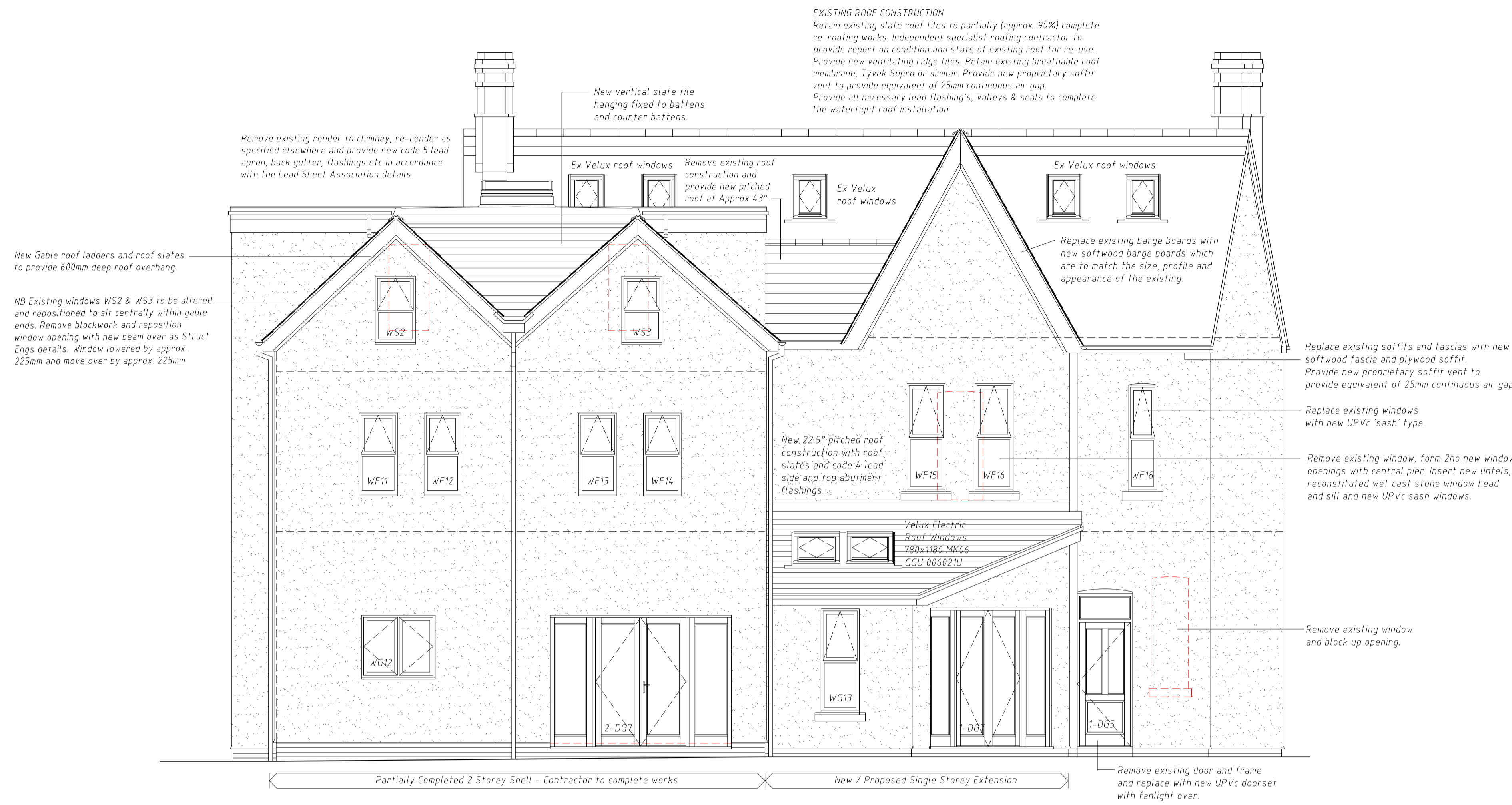
Rear Elevation 1:50