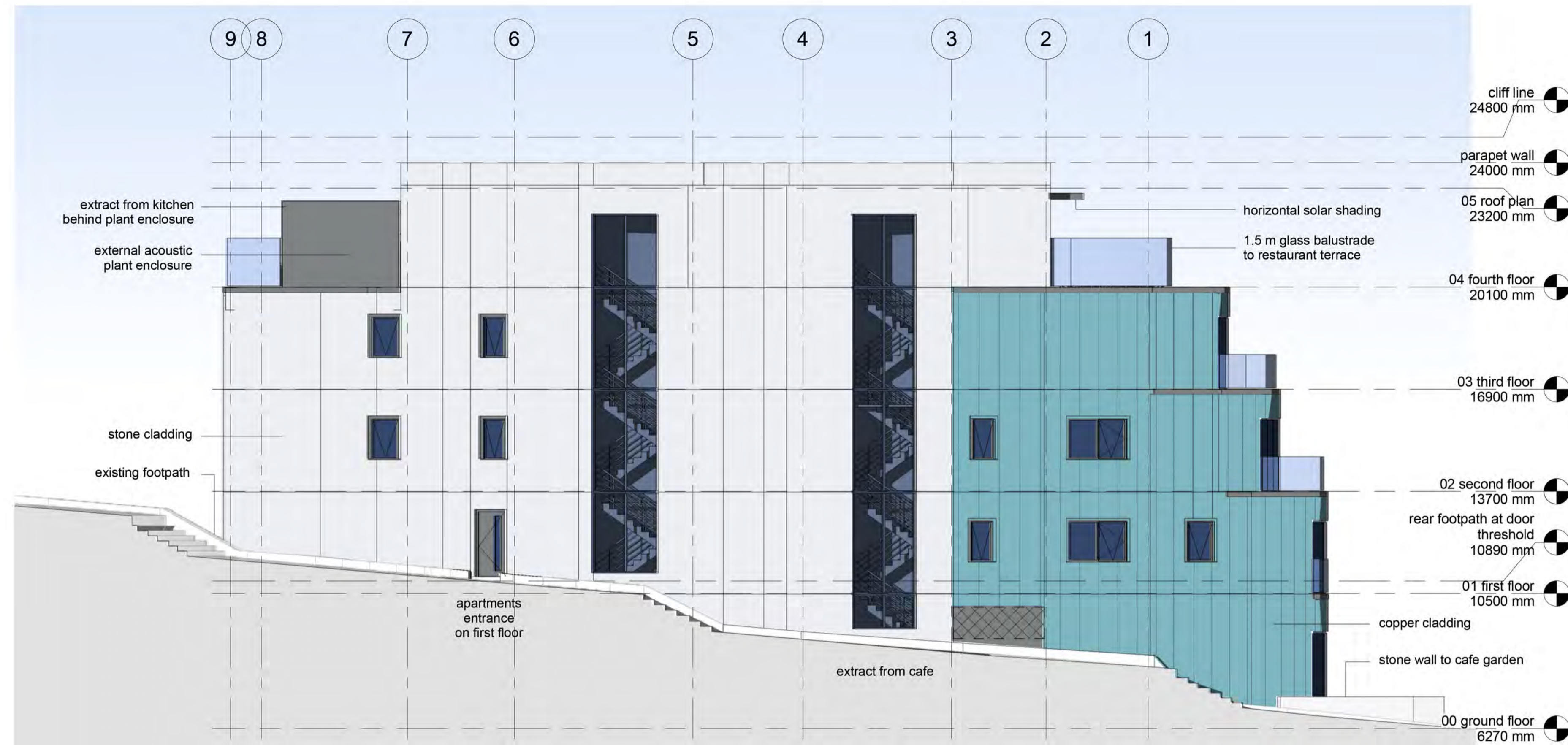
1 Elevation C North 1 : 100